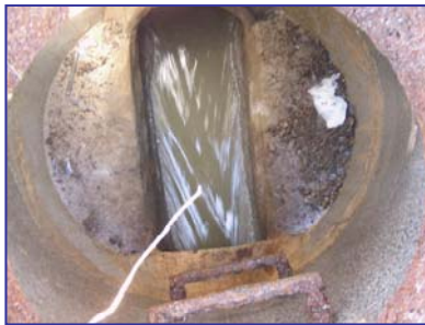
Flow measurements are taken throughout the collection system to determine the correct pump station upgrade size.

Pump Stations to be replaced on this project consist of the following: PS111, PS115, PS338, PS201, and the Woman's Hospital Pump Station. The upgrades will work in conjunction with force main upgrades in other South Forced Upper Basin projects to alleviate chronic SSOs at and near these pump stations.