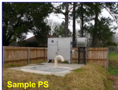
Five pump stations will be upgraded in the project area.