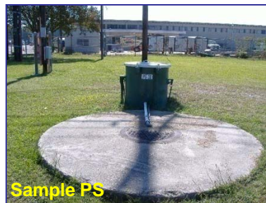
Five pump stations will be upgraded in the project area.